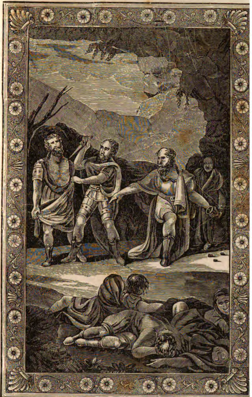
JOSEPHUS IN THE CAVE.